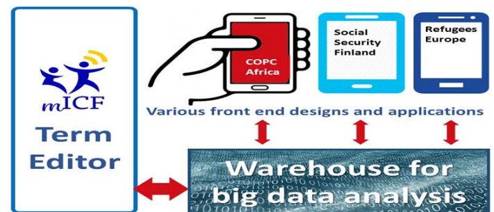
Figure 2: mICF vision of connection between various front ends, big data warehouse and Term editor

The mICF development includes big data analysis by connecting front end data capturing (the interface) with the back end (ICF Term Editor) (see figure 2). Currently the MVP prototype front end (interface) of mICF is bilingual in Finnish and English (see mock up derived from Finnish: https://projects.invisionapp.com/m/share/B77HCQ5XZ#/162952446 ). However, the front end can be of various interfaces and languages depending on the user group as presented in figure 2. For example: interfaces can be problem-oriented or goal-oriented. Currently, the back end (the Term editor) includes English, Finnish, Danish, Portuguese, Dutch, and German ICF terms. If funding becomes available, the plan is to add the Japanese, French, Chinese, Russian, Spanish and Swedish languages. The scalable design will allow the inclusion of all other languages as well. To link the natural terms to the ICF terms, a protocol has been developed and is in the process of ethical approval in several countries.